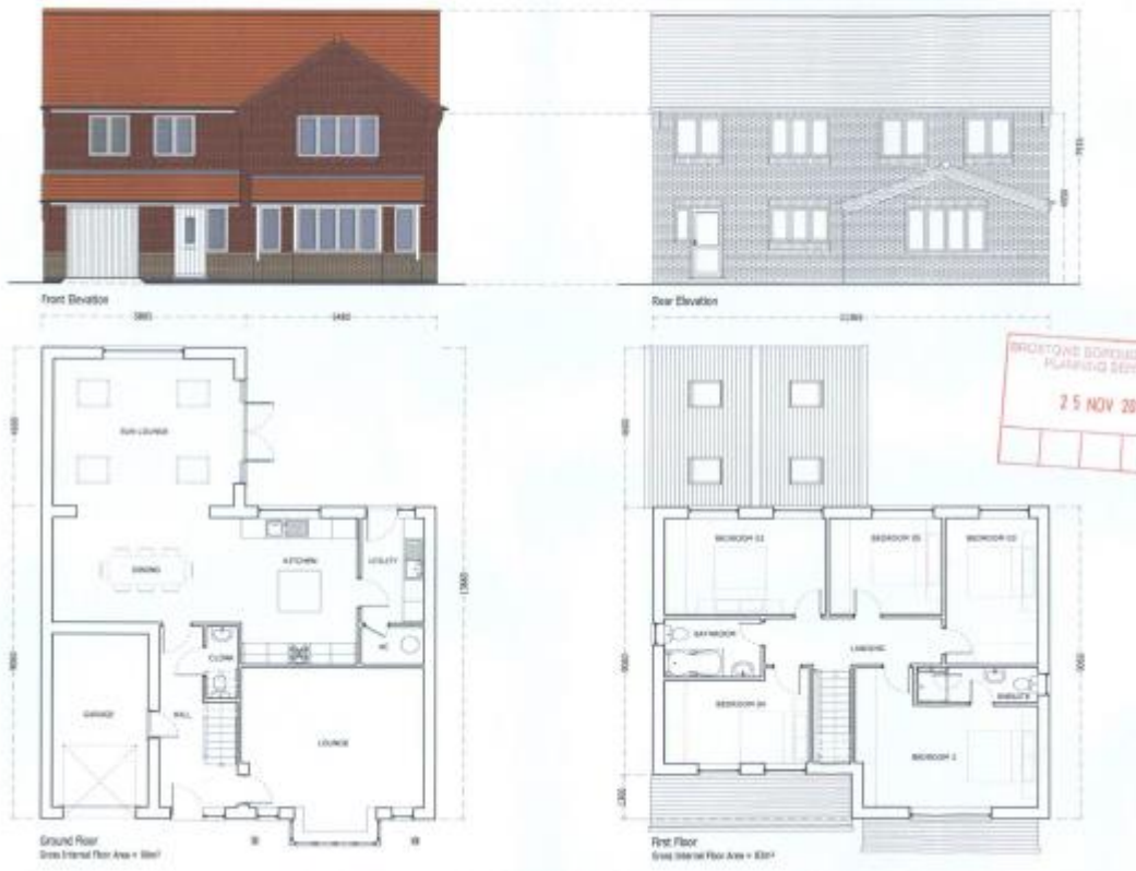
House type KE7

Site sections for plots 255, 257 and 259