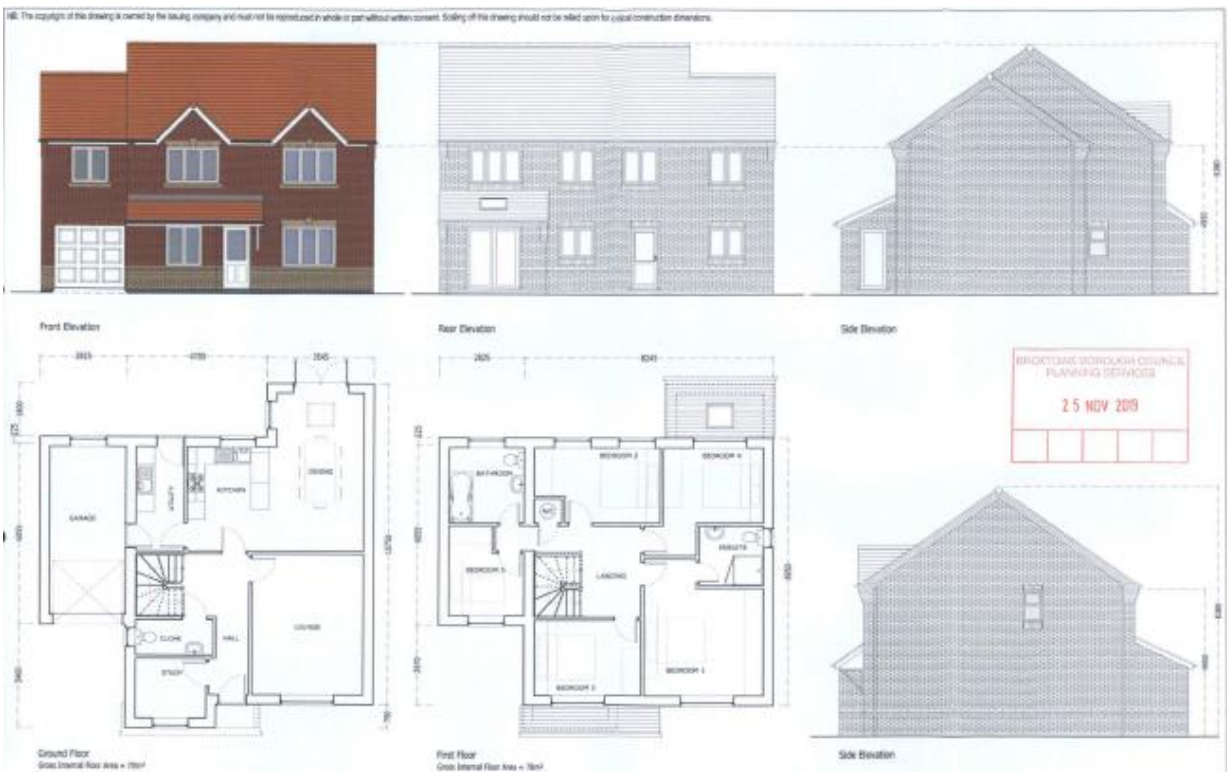
House type B6